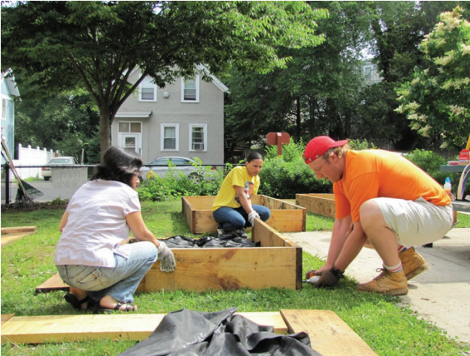
Participants in CWU's Career Family Opportunity program join nonprofit partners, South Boston Grows and The Shire, to build a community garden fostering self-sufficiency and providing nutritious foods for their families. June 2010.