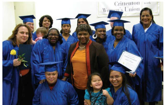
Photo: Graduates from CWU's Woman to Woman program, which provides computer training, professional development, and life-skills training to low-income women entering or returning to the workforce. July 2010.

attractive. However, this opportunity may not have come to light had not both organizations found themselves, in late 2005, facing the imminent departure of their respective CEOs. This served as an unexpected catalyst that brought the two boards together in a merger process that was launched in February 2006 and completed by July 1, 2006.